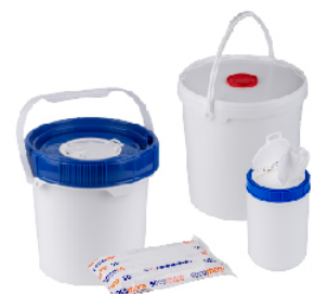
Different packaging available on demand