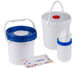
Different packaging available on demand